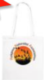
Classic Tote Bag $24.36