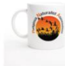
White 11oz Ceramic Mug $12.60 - $16.04